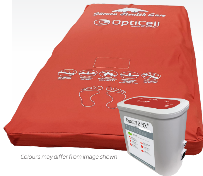
Colours may differ from image shown

* Categories defined by the International Pressure Ulcer Classification system. Guidelines produced by the European US National Pressure Ulcer Advisory Panels (EPUAP and NPUAP), together with the Pan Pacific Pressure Injury Alliance (PPPIA).